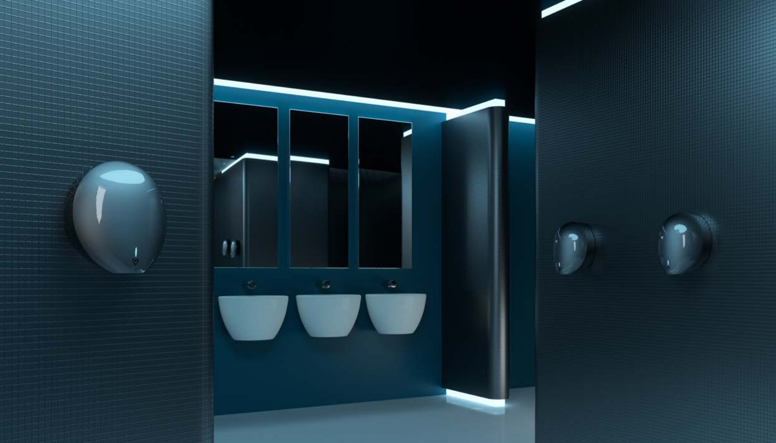
Pebble Mini Silver