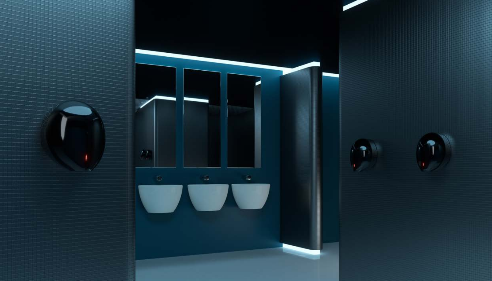
Pebble Mini Black